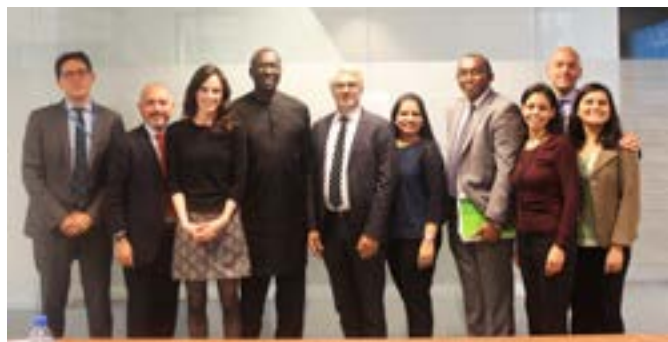
The TIWB Secretariat met in Paris, France on 21 May 2019 to review TIWB's progress to date, discuss TIWB's key challenges and develop an action plan going forward.

For the UNDP and its network of 170+ Country offices worldwide, TIWB is now recognised as an integral part of UNDP's offering to support countries finance their Sustainable Development Goals (SDG) priorities. As UNDP